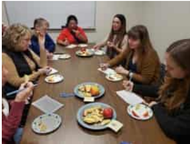
Apple research taste test

And my first reaction was...underwhelmed. Maybe I was too excited. Maybe I was expecting more. Don't get me wrong--it's a good apple . But after years of anticipation, I was more "meh" than "WOW". But that's just me. My apple taste preference differs from yours. So I decided that a research taste test was necessary--with my co-workers at the Larimer County Extension Office. They were eager to help.