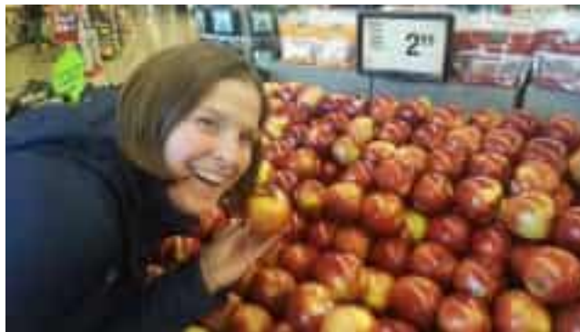
First sighting of Cosmic Crisp!

When I was in Oregon a couple weeks ago, I was at Safeway picking up a few things. And there it was. A bin of Cosmic Crisp. I actually yelled out loud. Then I did what any normal human would do--take a selfie by the apples.