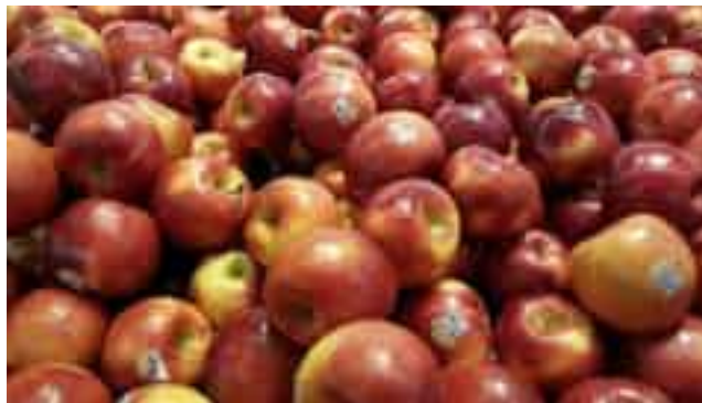
Cosmic Crisp apples

I think you can find out a lot about a person by looking at their phone's news feed. For me, you'd learn that I read a lot of stories about baking, golf, Taylor Swift, college football, and backyard chickens. Recently I've been inundated with news stories about the hottest apple on the market: Cosmic Crisp .