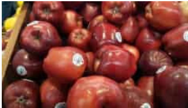
Red Delicious--looks better than it tastes

For what it's worth, Red Delicious scored at the bottom of all categories. Poor Red Delicious. Its highest ranking was for appearance, as it's your classic red apple, but taste was "watery" and "bland". One participant stated that it was her children's favorite apple, so it has a following.