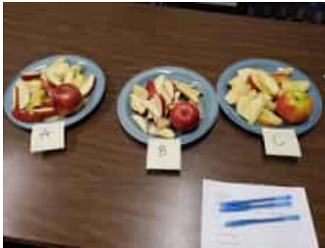
"A": Cosmic Crisp "B": Red Delicious "C": Honeycrisp

For what it's worth, Red Delicious scored at the bottom of all categories. Poor Red Delicious. Its highest ranking was for appearance, as it's your classic red apple, but taste was "watery" and "bland". One participant stated that it was her children's favorite apple, so it has a following.